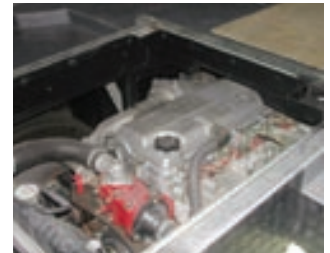
Easy Engine access