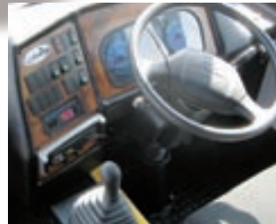
Driver's Comfort Zone