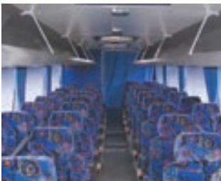
Passenger Comfort and Luxury