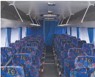
Passenger Comfort and Luxury