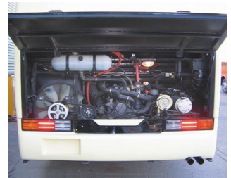
Easy Engine access