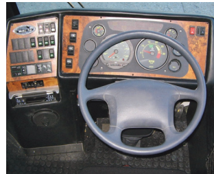
Driver's Comfort Zone