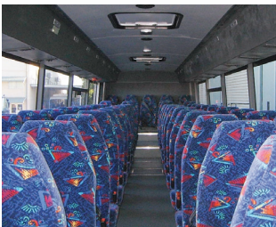
Passenger Comfort and Luxury